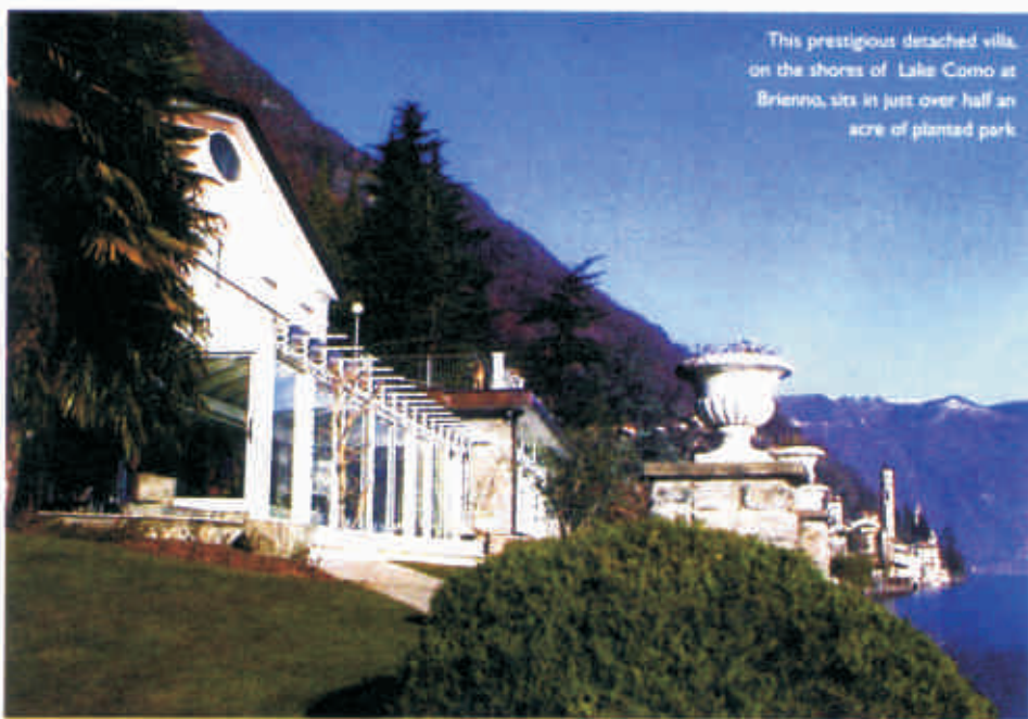
This prestigious detached villa, on the shores of Lake Como at Briennio, sits in just over half an acre of planted park.

Each of the lakes is distinctly different